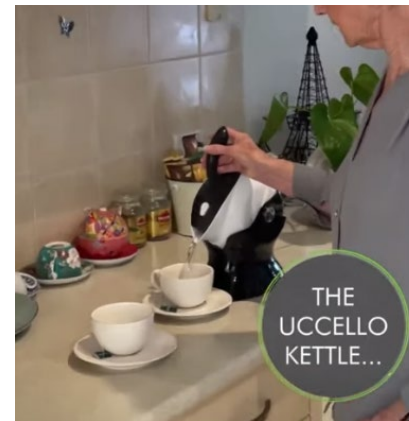
Elderly End User