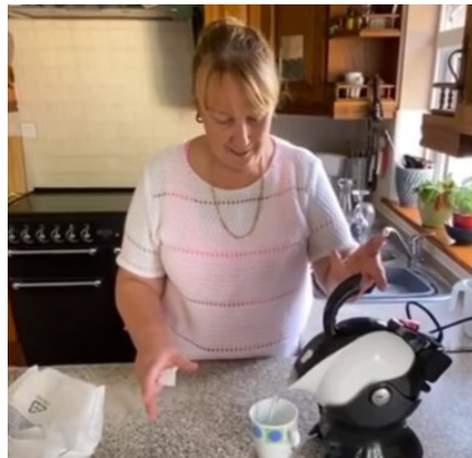
General End User