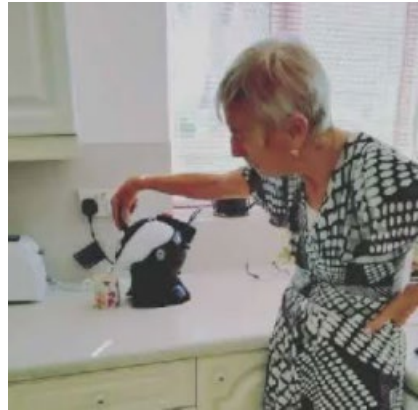
Elderly End User